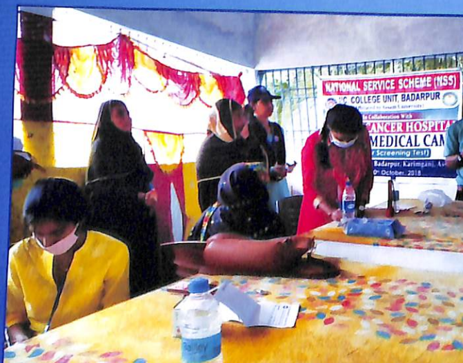
Special Medical Camp organised by NSS collaboration with Cachar Cancer Hospital