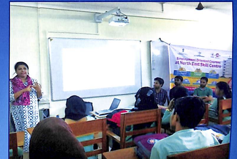
Career & Counselling Cell Programme with North East Skill Centre of Guwahati