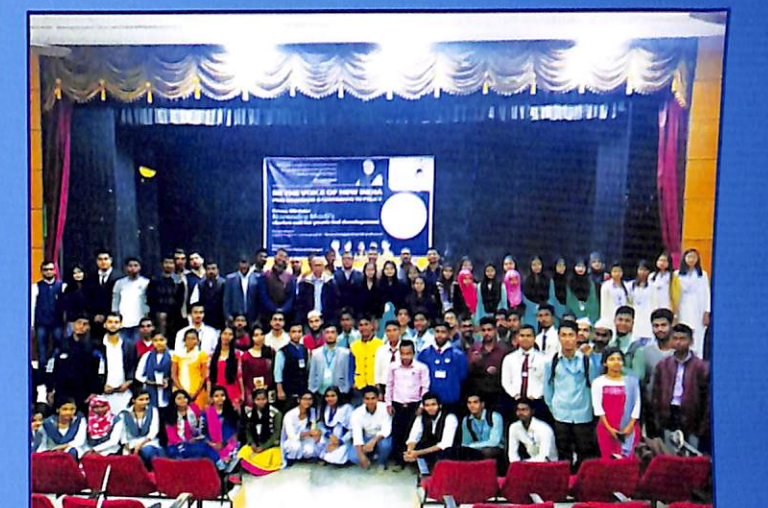
Participants from NC College at District Youth Parliament held in AUS organised by NSS