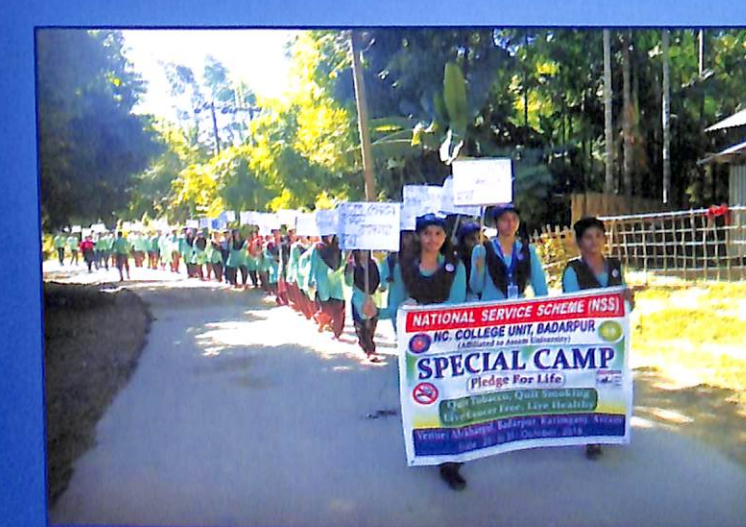
NSS Special Camp Rally at Alekhargool Badarpur