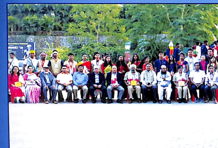
NSS Volunteers from NC College in the N.E Regional Pre RD Camp at USTM, Guwahati