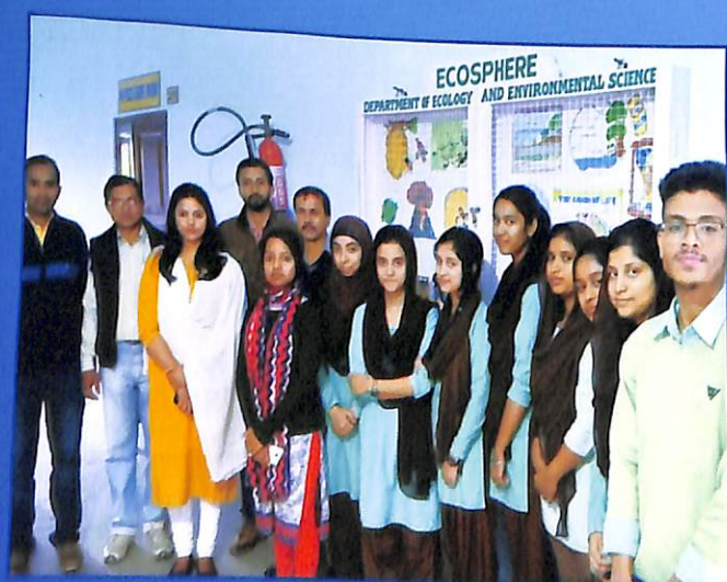
Inauguration of Wall Magazine 'ECOSPHERE' Dept. of Ecology & Env. Science