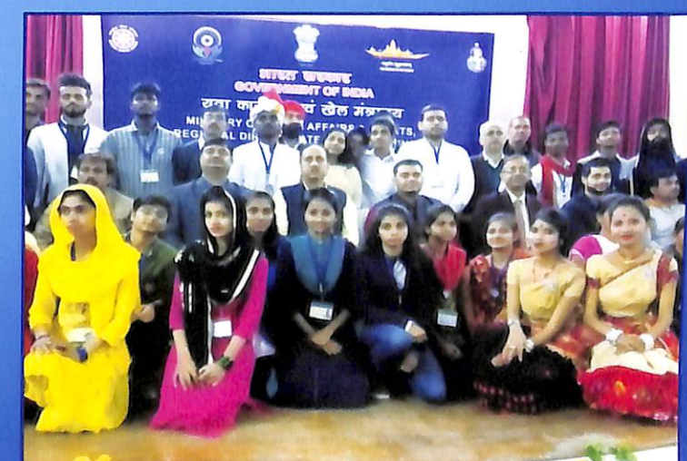
NSS Volunteers at National Integration Camp in BHU, Varanasi