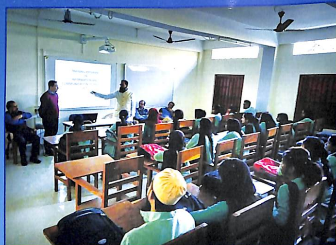
ICT Awareness Programme by B.Voc IT Deptt.