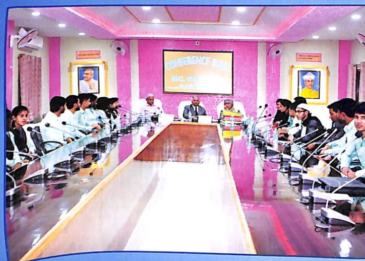
Naac Peer Team with Students