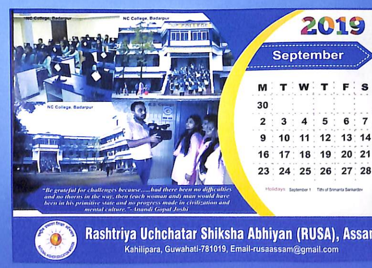
Photo of NC College in RUSA Calendar 2019