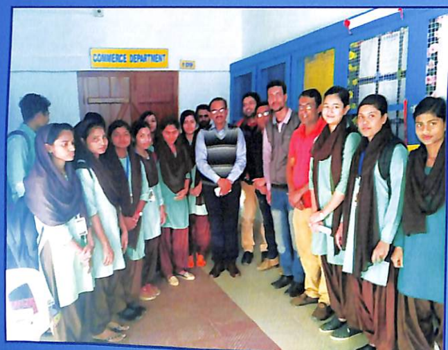
Inauguration of Departmental Wall Magazine 'Heritage' of the Dept. of History