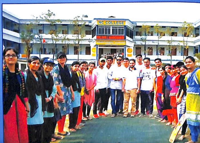
A click of Girls Cricket Final Match, ASW - 2018-19