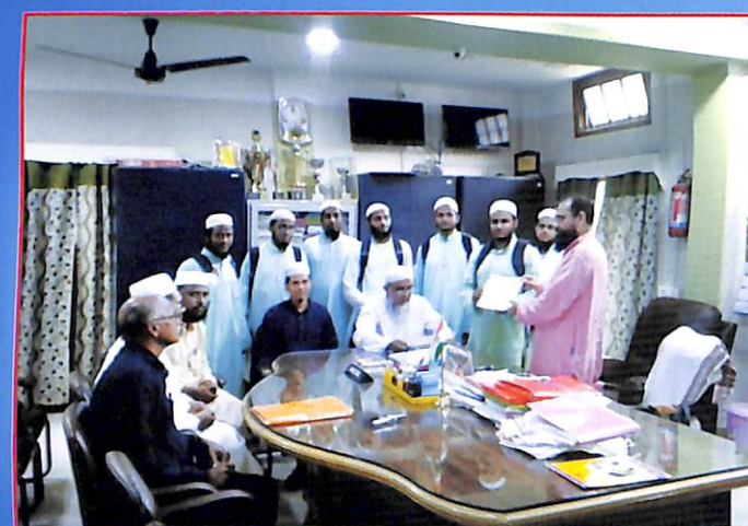
Certificate Distribution of Departmental Seminar, Arabic