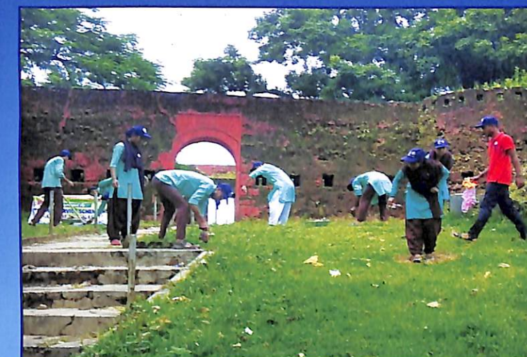
Safai Abhijan by NSS at Badarpur Fort