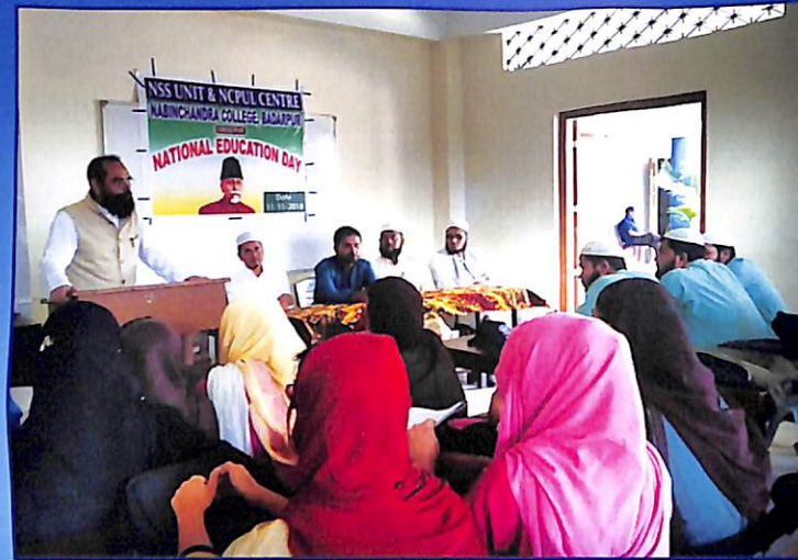
Observation of National Education Day by NSS & NCPUL