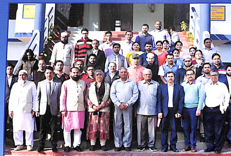
Naac Peer Team Visit on 7th & 8th January 2019