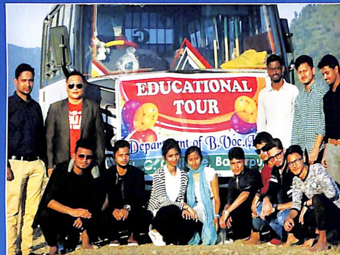
B.VOC IT Educational Tour