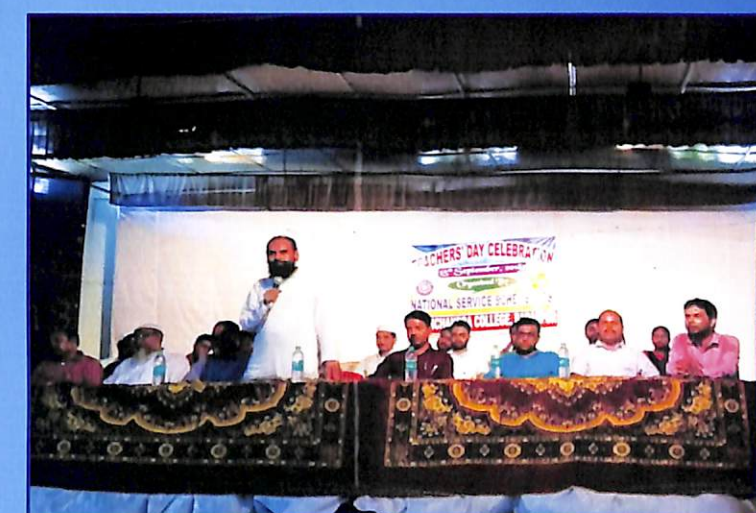
Teachers Day Celebration organised by NSS