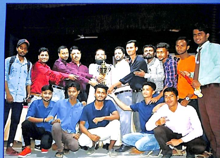
Champion of Cricket in ASW - 2018-19