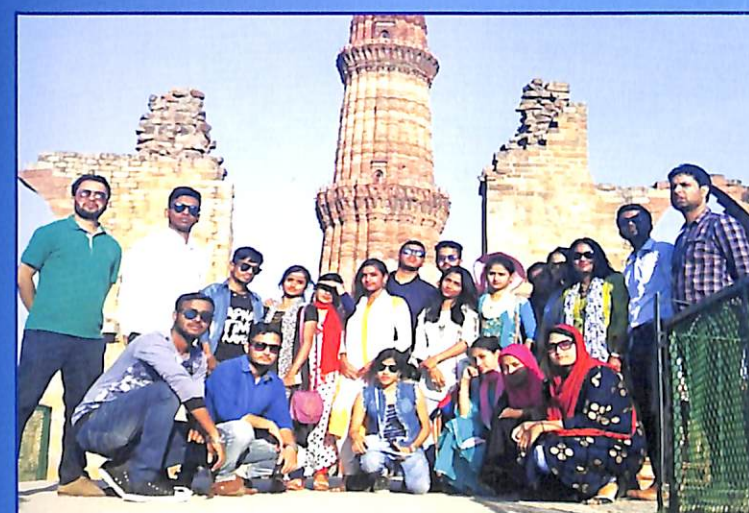
A click at Qutub Minar, New Delhi