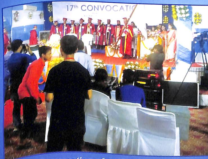
17 Convocation of AUS, 14 March 2019