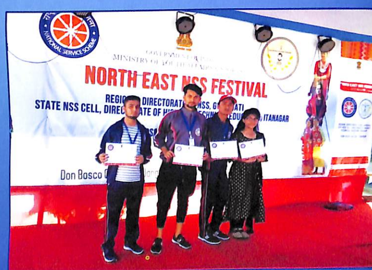
NSS Volunteers in North East NSS Festival in Itanagar