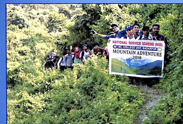
NSS Mountain Adventure 2018