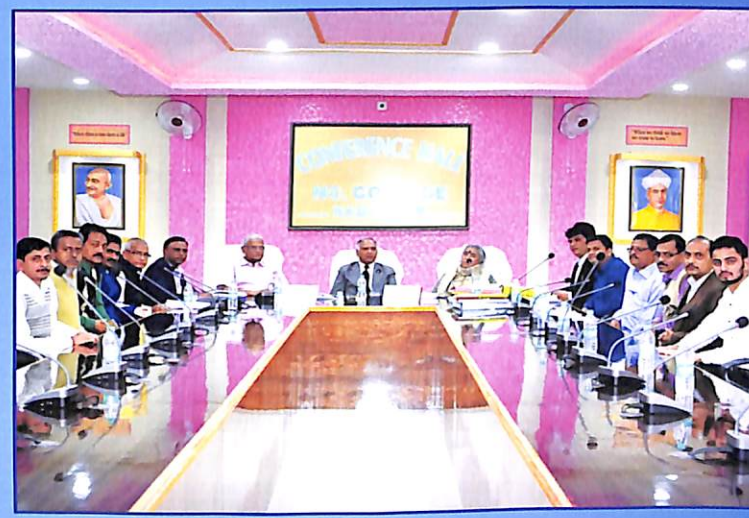
Naac Peer Team with Alumni 7th January 2019