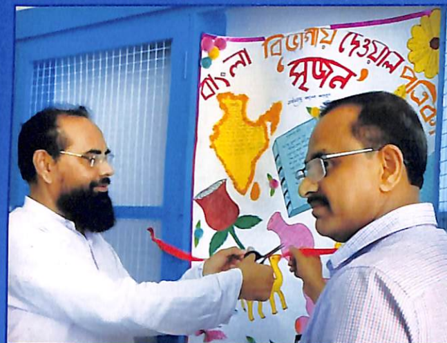
Inauguration of Wall Magazine 'Srijan' 2018 Department of Bengali