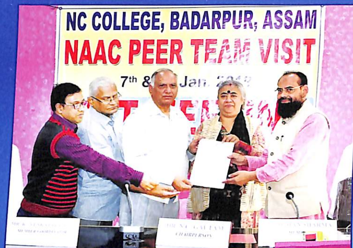
Handling over Report of Peer Team