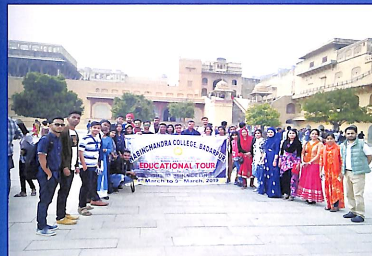
A click at Amber Fort, Jaipur Rajasthan