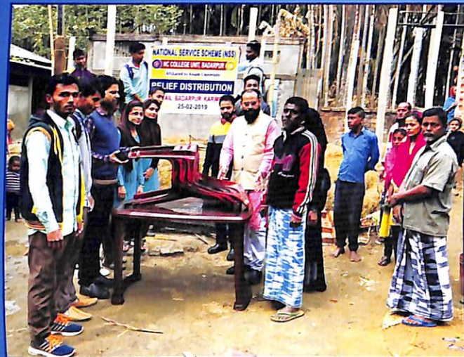
NSS Relief Distribution in the fire ravaged houses of Deorail, Badarpur