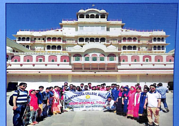
A click at City Palace, Jaipur