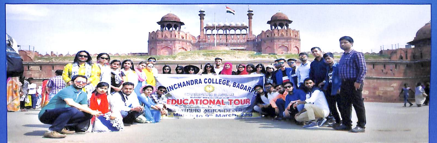
A click at Red Fort, Delhi during Educational Tour 2019