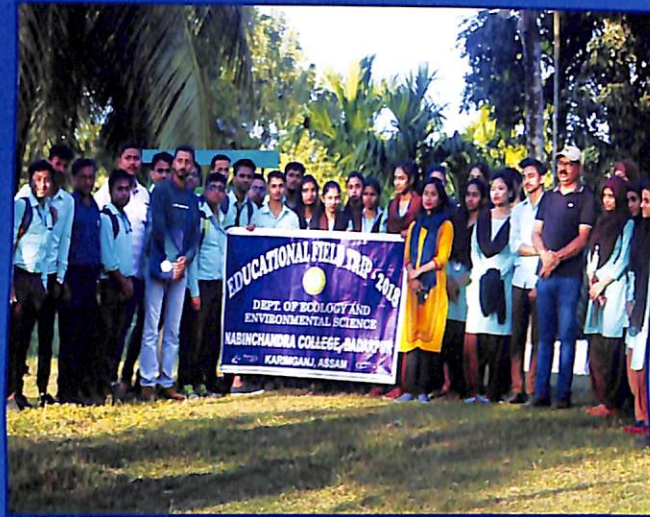
Educational Tour at Krishi Vigyan Kendra, Cachar by Dept. of Ecology & Env. Science