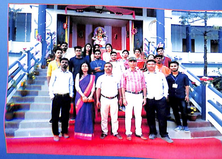
Saraswati Puja 2019