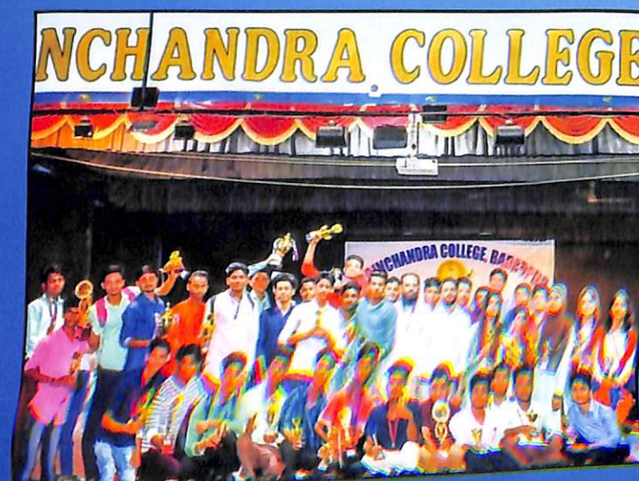
A happy moment at the end of Annual Social Week 2018-19