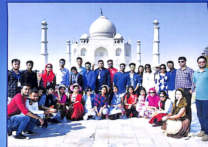
A click at Taj Mahal, 2019 during Educational Tour