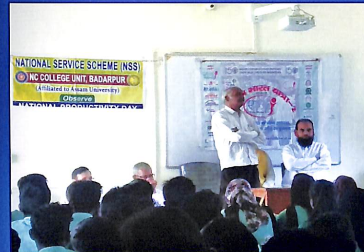
Swasth Bharat Yatra - 2 programme in NC College