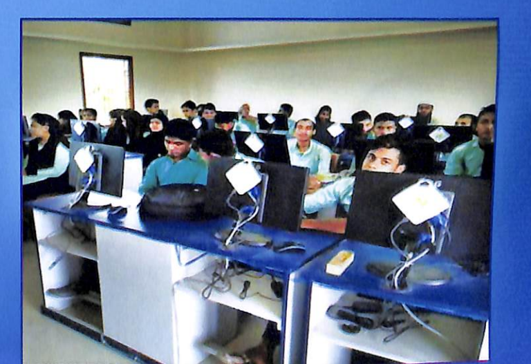
B.VOC IT Lab