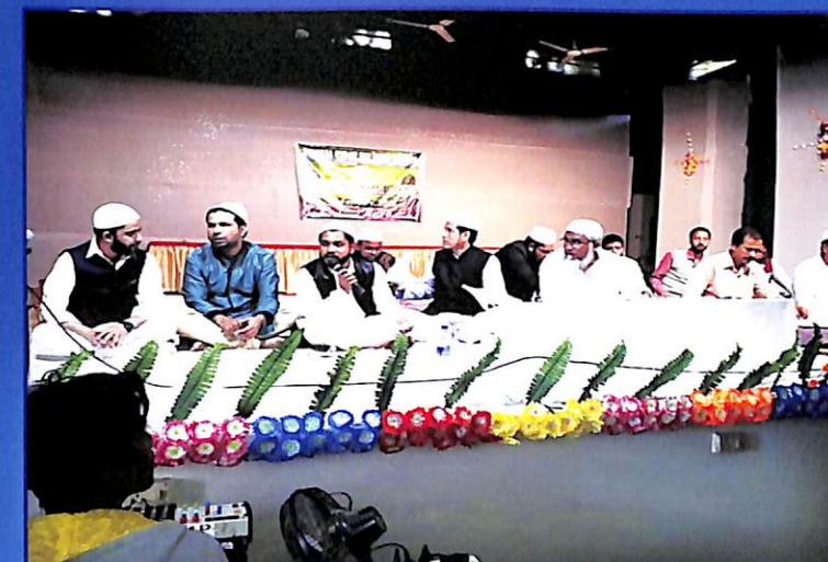
Annual Sirat Un Nabi Mahfil 2018-19