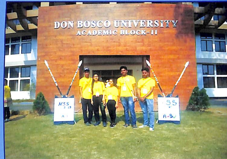
NSS Volunteers in Youth Festival at DON BOSCO University, Guwahati