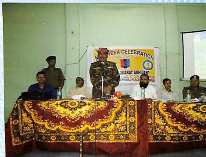
N.C.C. week celebration