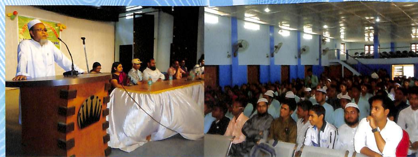
Parting social ceremony