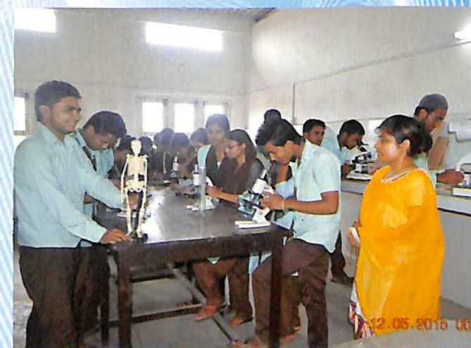
Life Science Lab.