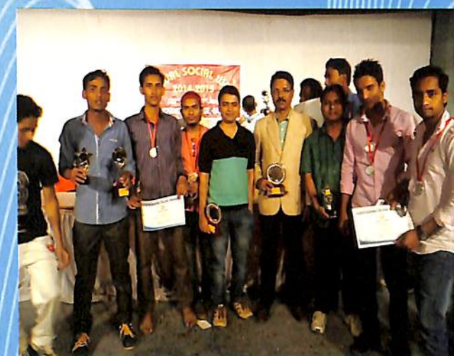
Annual Social week committee