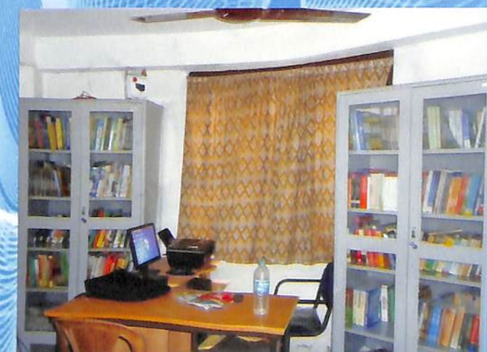
U.G.C. entry in service coaching Centre