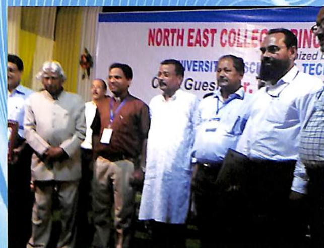
Principal with A.P.J. Kalam at N.E. Principals' conclave