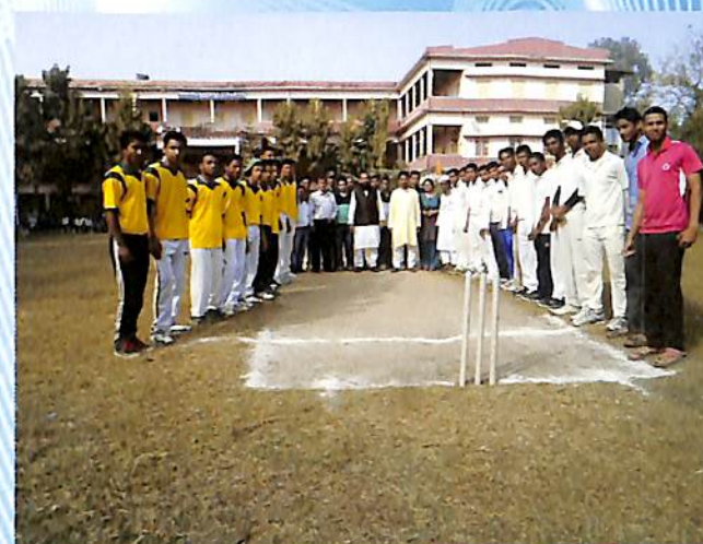
Teams of Final Cricket Match