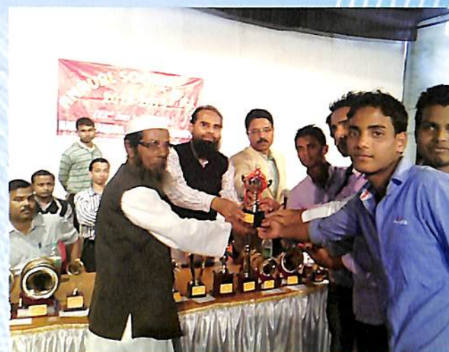
Prize distribution of Annual Social week