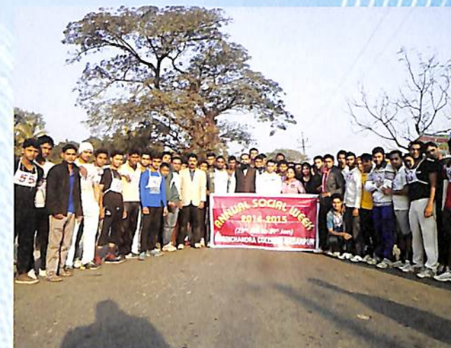
Participants of Marathon Race