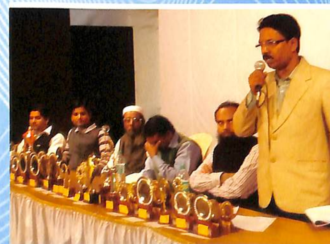
Prize distribution of Annual Social week