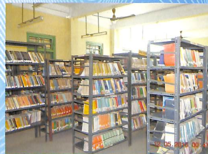
A Part of Central Library