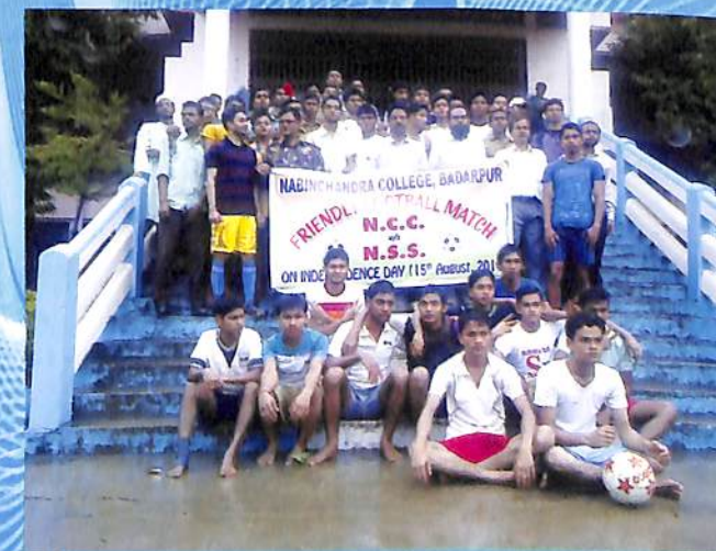
N.S.S. and N.C.C. Football Teams