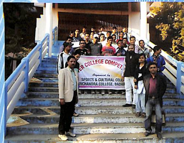
Inter College Competition