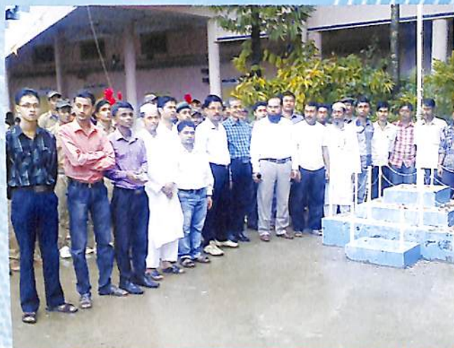
Independence day Celebration