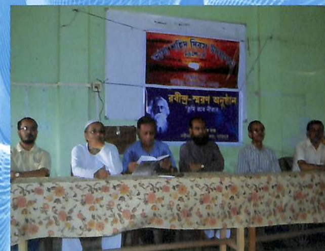
Bhasa Shahid Divas