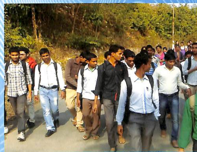
Participants of N.A.T.S. Exam. at A.U.S.