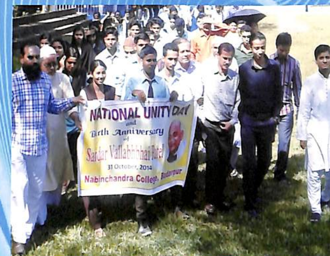
Observance of National Unity Day