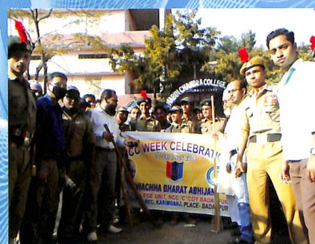
Swachha Bharat Abhijan