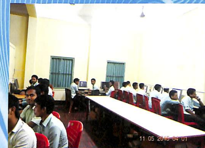
Commerce Computer Lab.