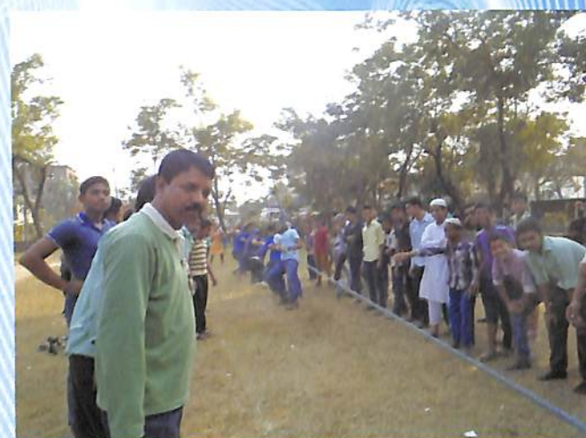
Events of Annual Social week