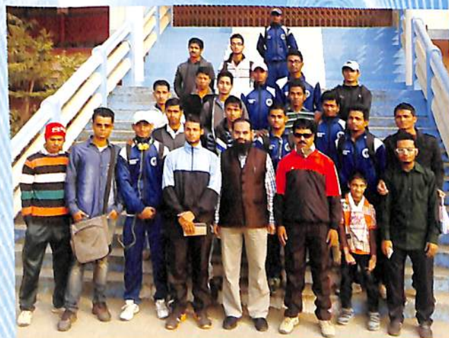
Cricket Team with Principal, Teacher i/c & Coach