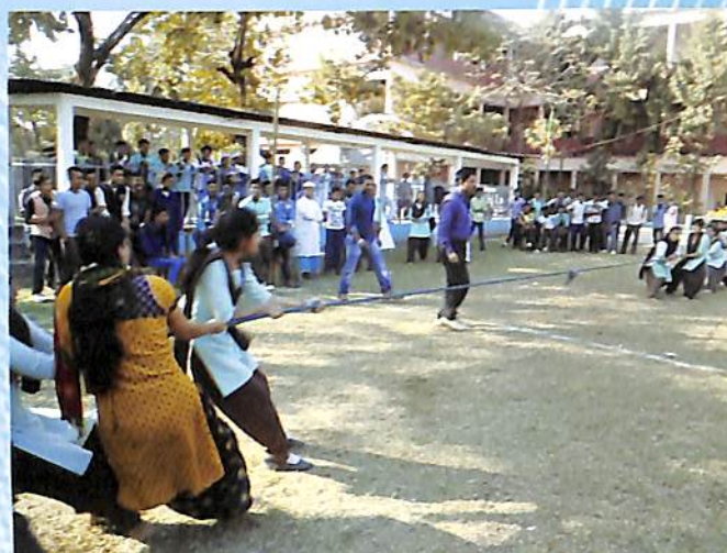
Events of Annual Social week