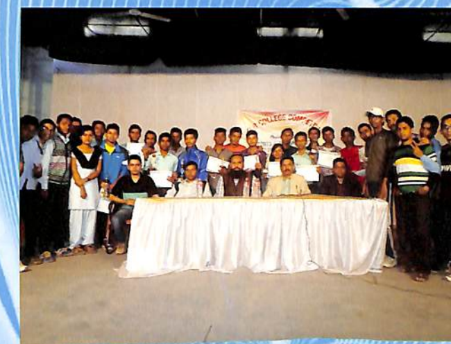
Participants of Inter College competitions