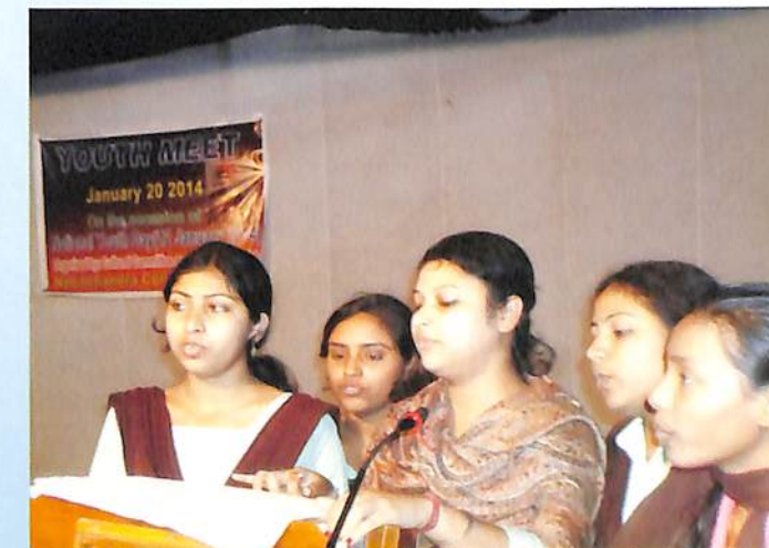
A View of Youth Meet 2014