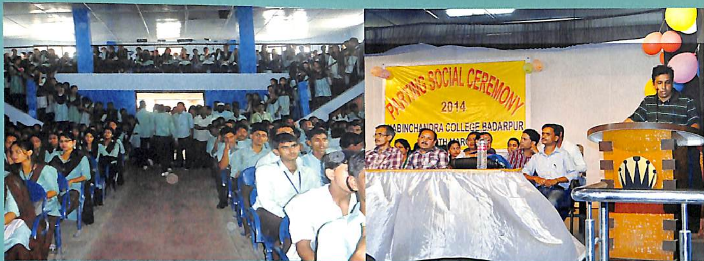
Moments of Parting Social Ceremony 2013-14