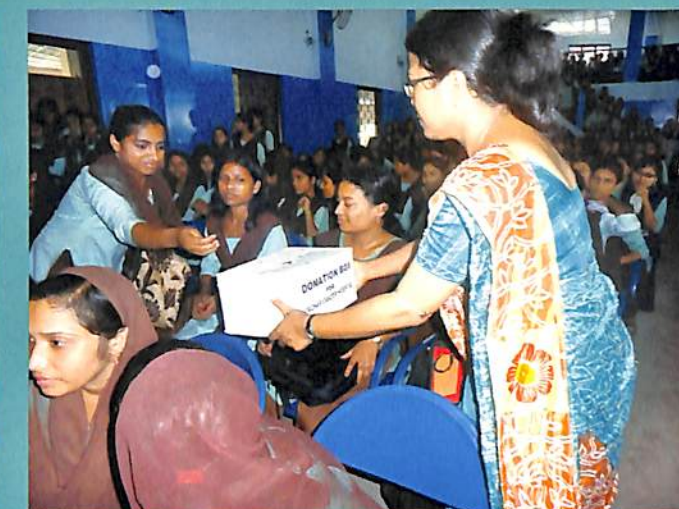
Views of Donation for Cachar Cancer Hospital