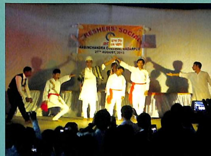
A View of Freshers' Social Programme 2013-14