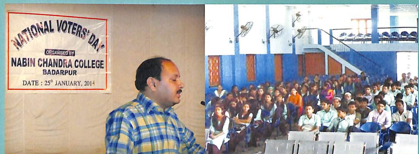
Moments of National Voters Day Programme 2013