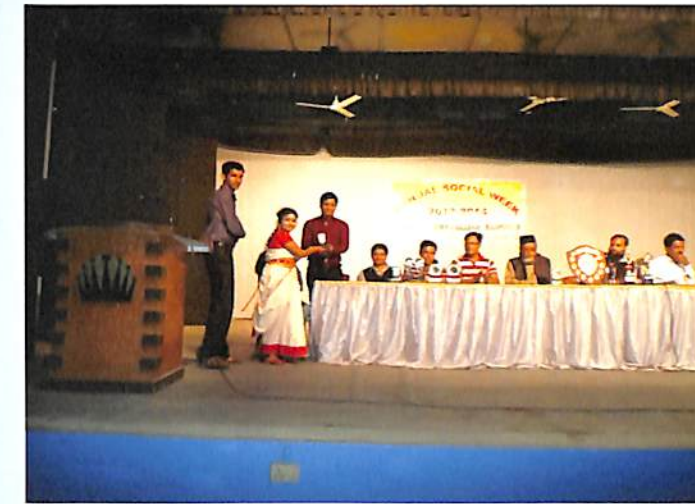
A View of Annual Social Week 2013-14