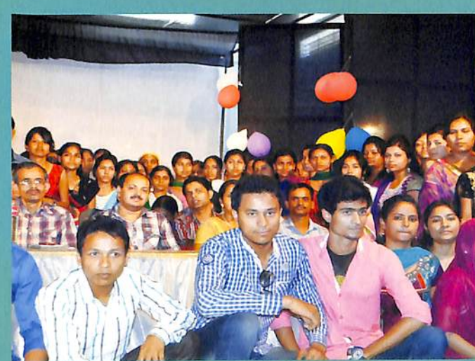
Views of Parting Social Ceremony 2013-14