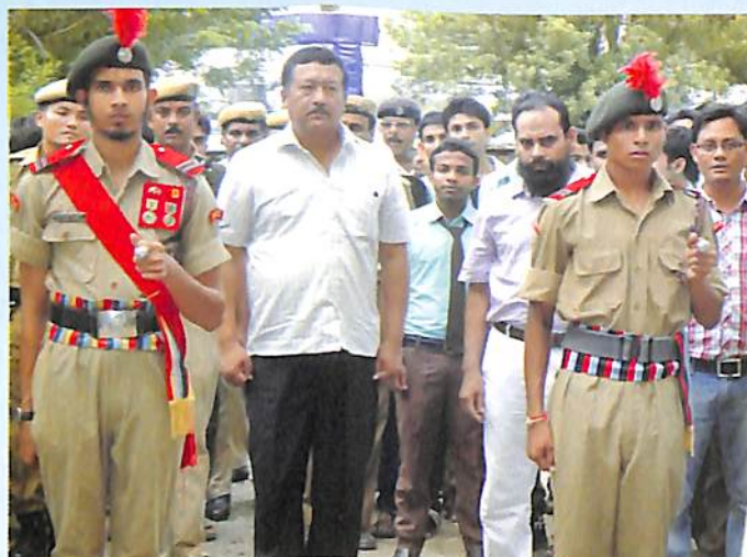
Moments of freshers' festival 2013-14