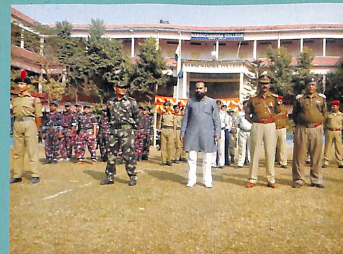
A View of Republic Day 2014