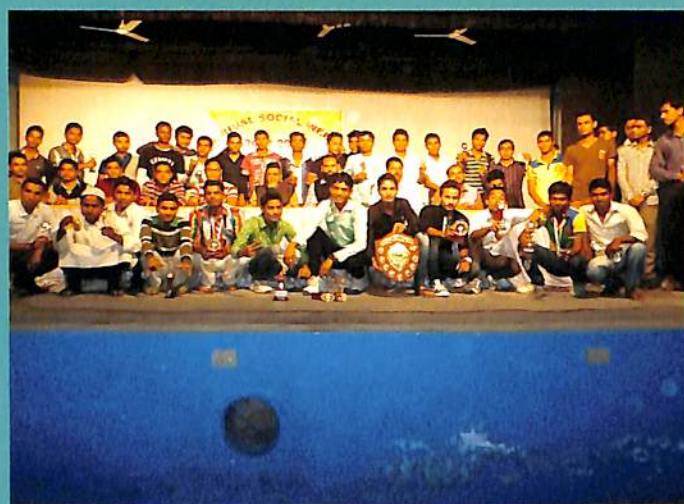
Views of Annual Social Week - 2013-14