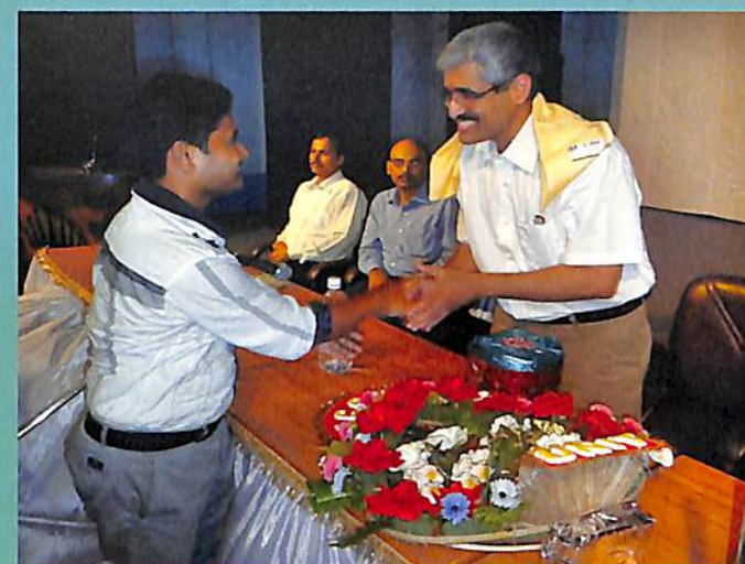
Views of Cancer Awareness Programme at N.C. College