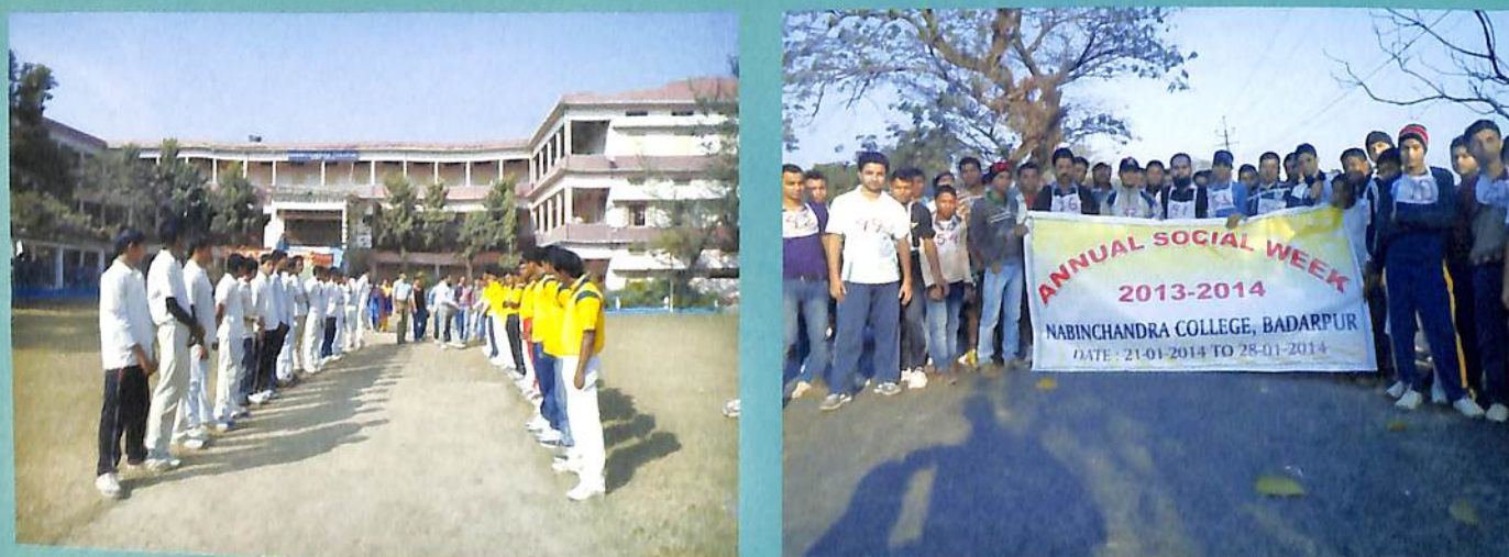
Views of Annual Social Week 2013-2014