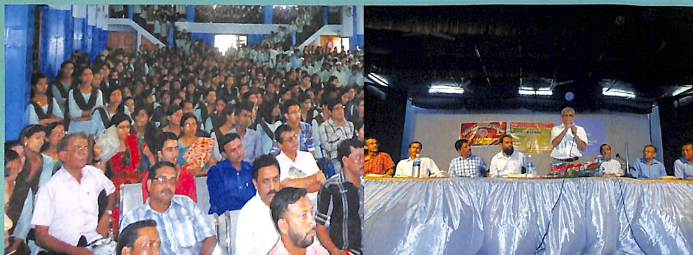
Views of Cancer Awareness Programme 2013