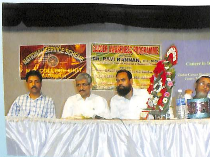
Cancer Awareness Programme held at N.C. College 2013