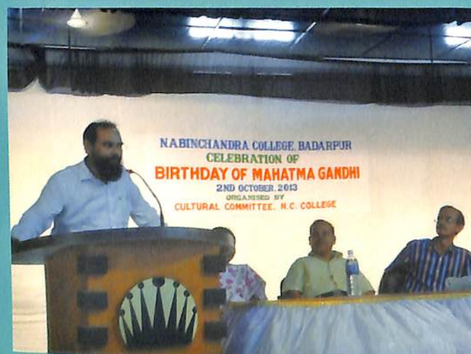
Views of Birthday Celebration of Mahatma Gandhi - 2013