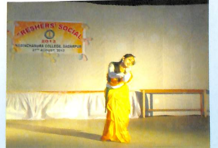
Moment of Freshers' Social 2013