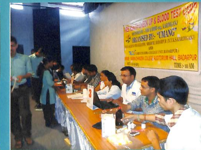
Views of Free Health Check-up at N.C. College 2013