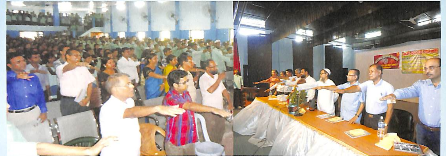
Moment of Oath taking for not consuming tobacco, Drugs etc at Cancer Awareness Programme