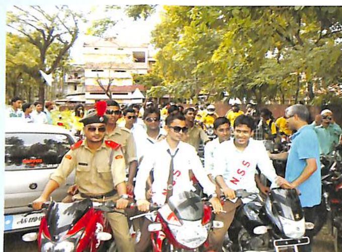
Anti-tobacco Rally 2013