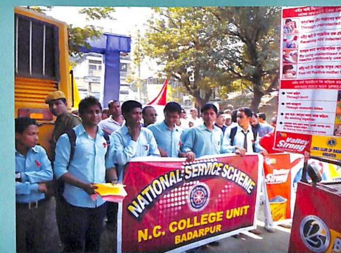
Moments of World Aids Day Rally