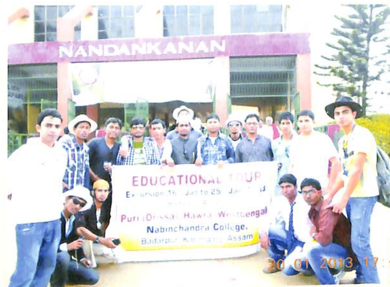
A scene from Educational Tour