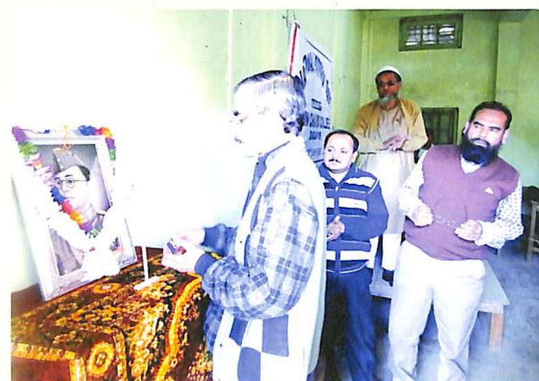
Celebration of Netaji Birthday at N.C. College