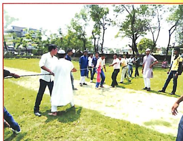
Tug of War Competition between Teachers and Students