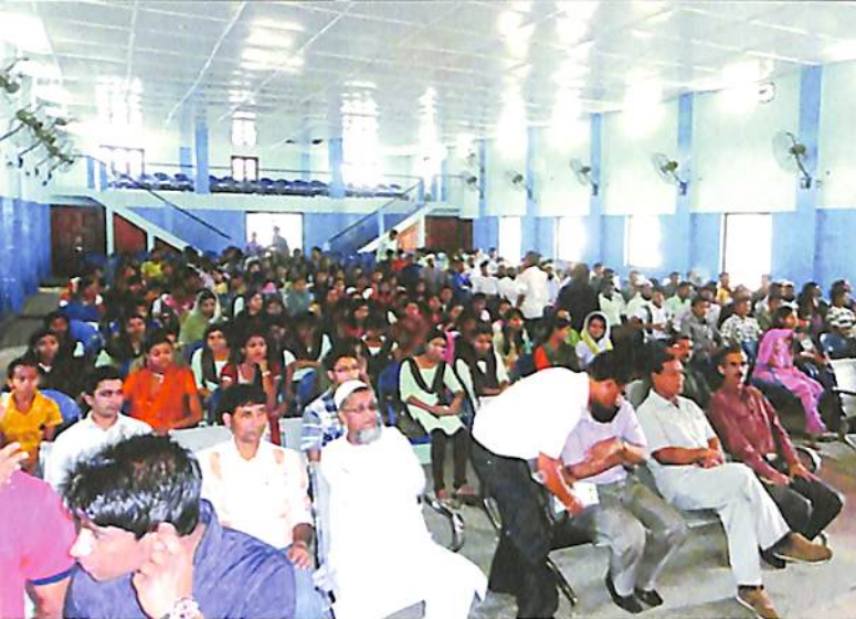
VC, AUS addressing National Seminar at the auditorium of N.C. College