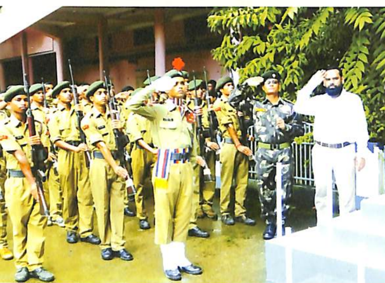
Celebration of Republic Day at N.C. College