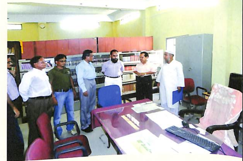
V.C., AUS visiting Library of N.C. College