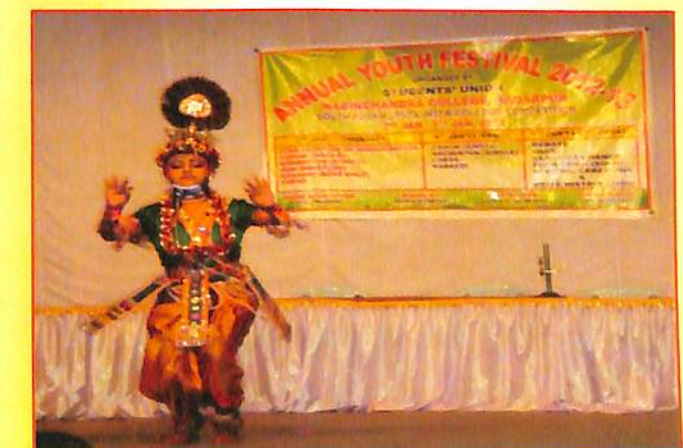
Student performing in Youth Festival