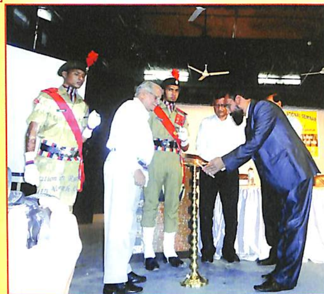
Inauguration of National Seminar by lighting the lamp