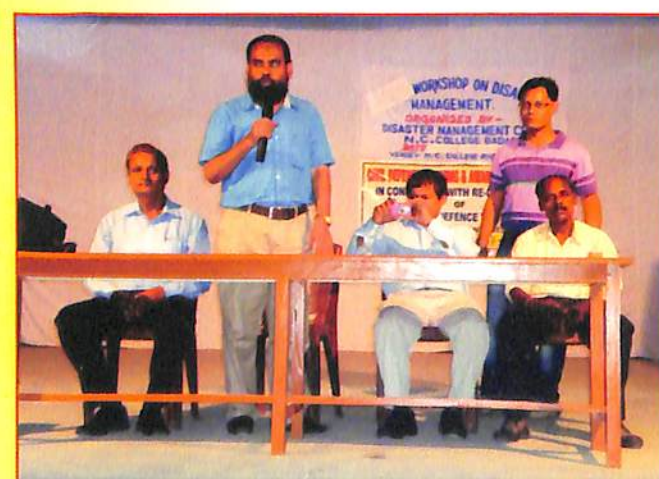
Workshop on Disaster Management at N.C. College