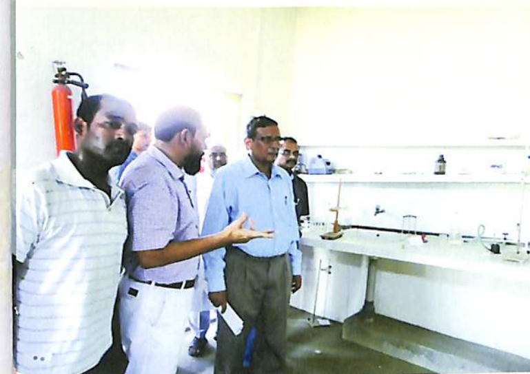
V.C., AUS visiting Science Laboratory of N.C. College