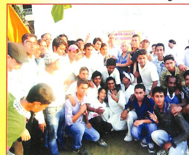
Honourable Minister of Sports, Govt. of Assam and DSA (Silchar) Secretary handing over Champion Trophy of Inter College Competition (AUS) to the Champion Team of N.C. College