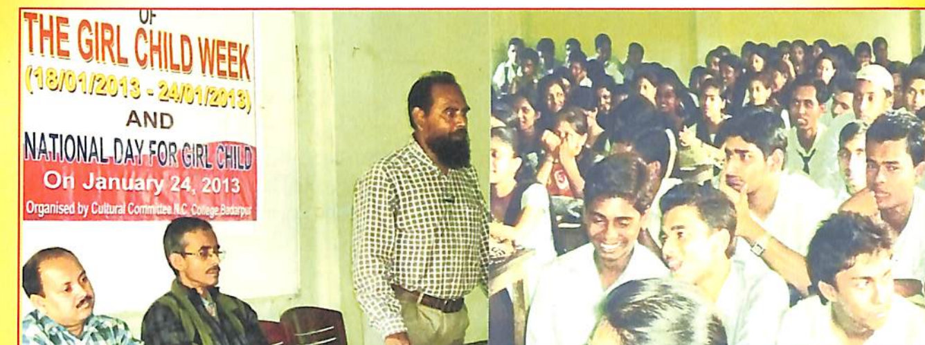
Celebration of Girl Child Week at N.C. College