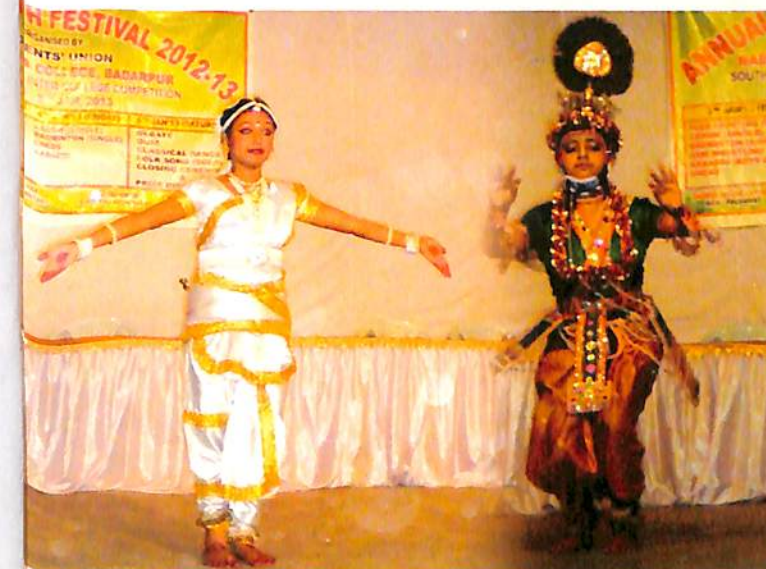
Female students performing dance in the South Assam Level Inter College Competition, organised by N.C. College