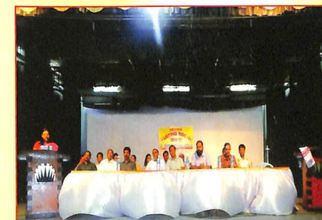
A scene of Parting Social 2013