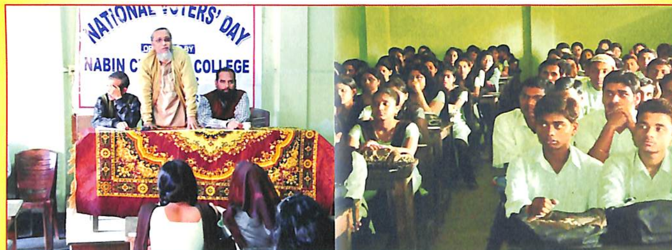
Celebration of National Voters' Day at N.C. College