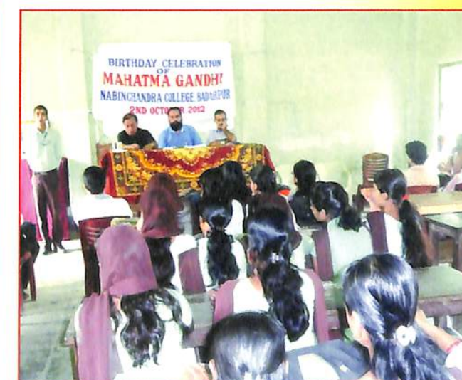
Celebration of Mahatma Gandhi's Birthday at N.C. College