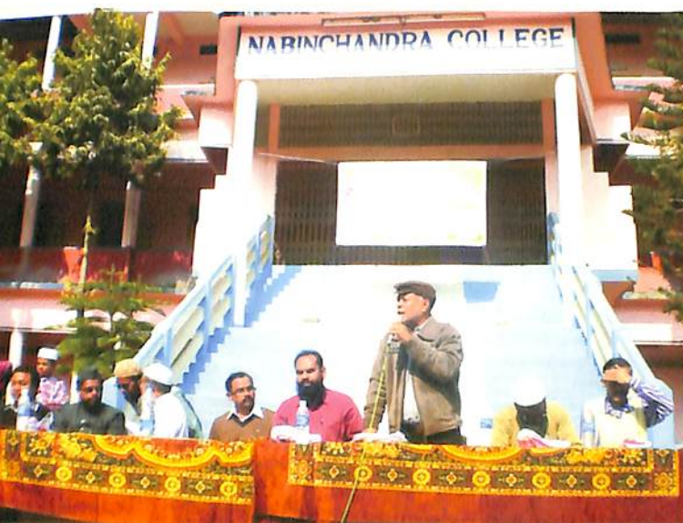
President G.B. inaugurating the South Assam Level Inter College Competition at Annual Youth Festival 2012-13