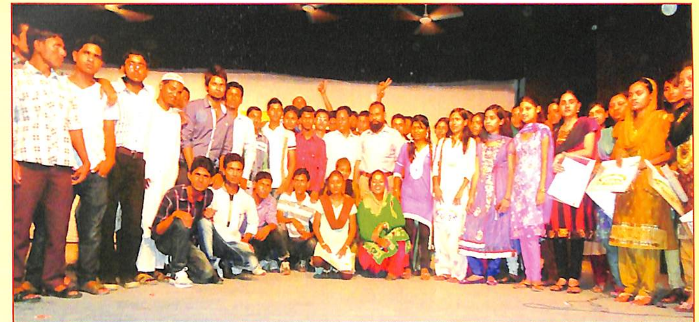
Group photo of TDC outgoing student 2013 with the Principal and Teacher in-charges