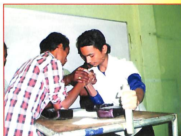
Arm Wrestling Competition in Youth Festival