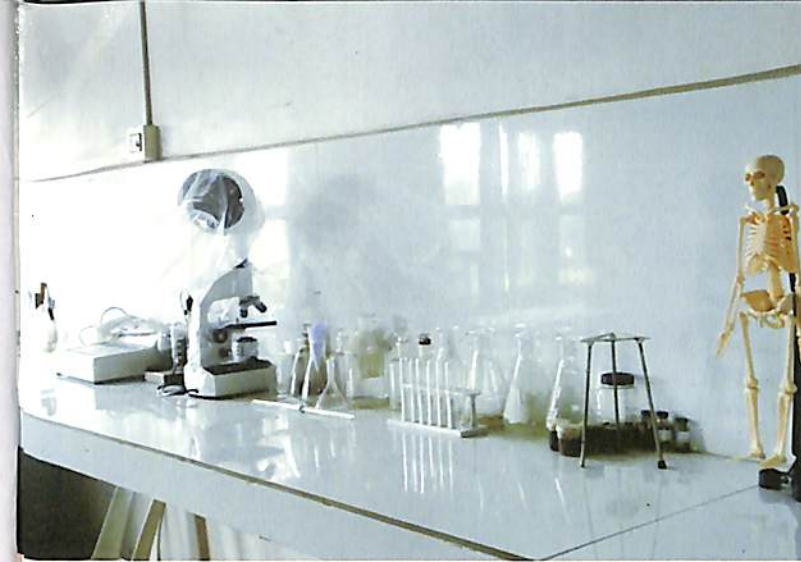
A view of Science Laboratory